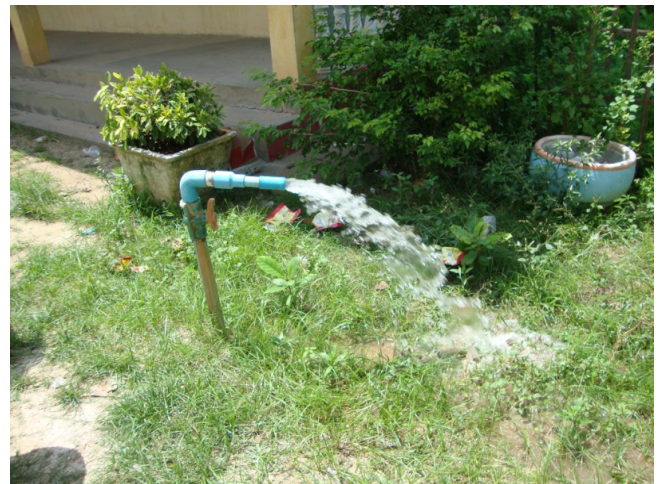
Electric pump tube well