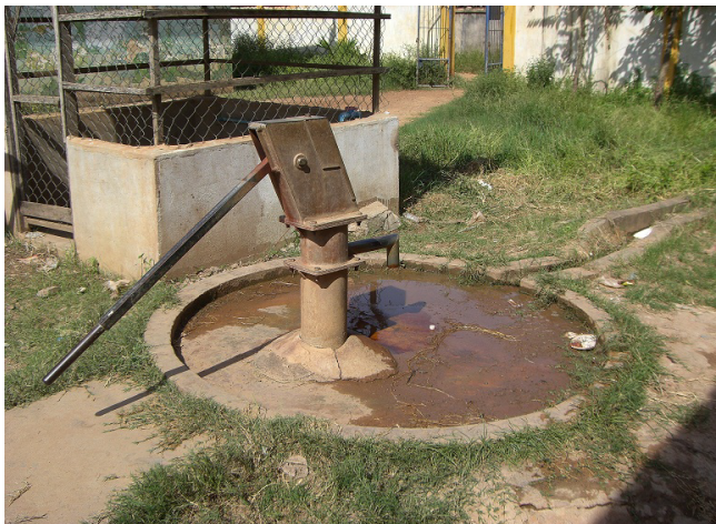
Hand pump tube well