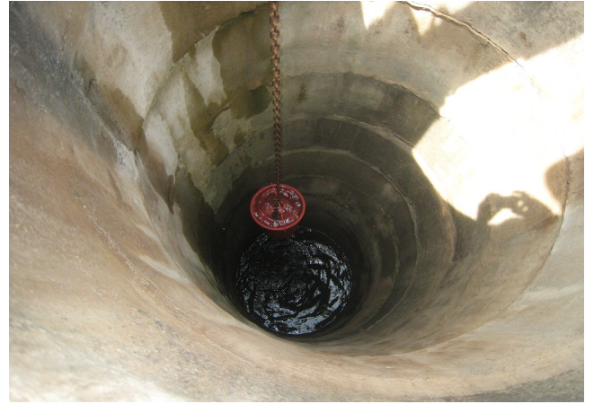
Hand dug shallow well