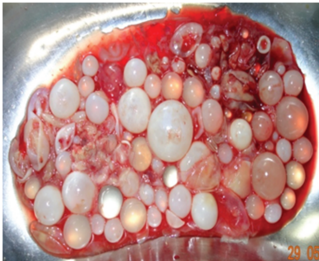
Figure 4: Multiple Daughter Cysts

cyst have been reported in neck, trunk and proximal part of limbs, may be because of relatively less muscle contraction in these areas [6,7]. Hydatidosis presenting as a painless, gradually progressive swelling should be included in the differential diagnosis of soft tissue swellings especially if the patient gives history of agricultural background or has been in contact with livestock.