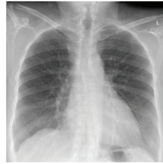
Figure 4: Chest X-ray post-operative showing regression of the superior mediastinum after the surgical resection of the large RSG.