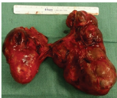
Figure 3: Specimen of the whole thyroid gland after resection with both components the neck and the mediastinal parts.