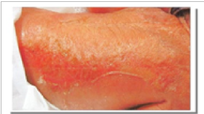
Figure 2: clinical improvement seen on the lesions of the burns 96 hours after the commencement of treatment with silicone gel covered with silicone impregnated dressing