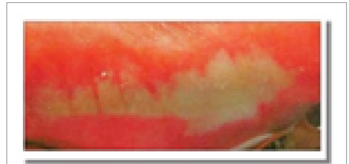
Figure 1: Burns detected on the skin along the chest and abdomen at 18 hours of life

The gel on application to the skin forms a flexible protective silicone covering, which on drying is gas permeable, waterproof and enables wound healing by re-epithelialisation [2]. The fine layer of the silicone gel protects the damaged epidermal layer of the skin from friction secondary to factors such as linen or patient handling during cares. The drying of