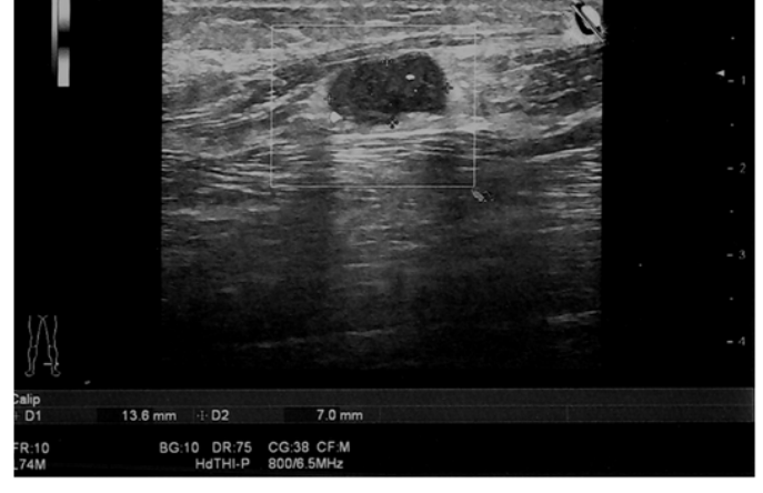
Figure 1: Ultrasonography scan of the external compartment of the left leg Presence of a well-defined, ovoid-shaped, homogeneously hypoechoic, lesion in the peroneus longus muscle.

The first report describes6 a 55-year-old male patient with a 6-month history of burning pain at his right fourth toe and at dorsal fourth web space, worsened pressing the mid-calf region. Physical examination of the foot was negative, but a palpable fullness in the proximal right leg was found. The patient underwent no diagnostic imaging, but a surgical exploration demonstrating a mass ensheating the superficial peroneal