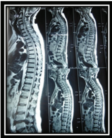
Figure 2: MRI of Spinal Cord showing mild degenerative disc disease at C3-5 and L5-S1 levels and C5-6 disectomy and fusion

tools necessary to develop a satisfying and productive post disease/injury lifestyle. Physiotherapeutic rehabilitation following such condition includes prevention of secondary complications from bedsores, pulmonary complication, deep vein thrombosis, autonomic dysreflexia etc.; postural reeducation and positioning; maintenance of muscle property and joint range of motion; retraining for bed mobility, activities of daily living and transfer techniques; relaxation techniques; management of bowel and bladder. Educating the patient and his family members of the condition