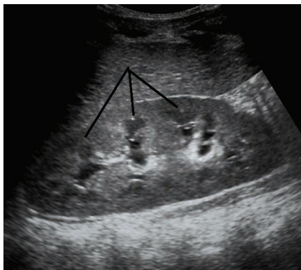
Figure 1: Ultrasound of the right kidney showing mild hydronephrosis

The patient was then transferred to the pediatric nephrology unit (PNU), where the urinary catheter was eventually removed. On the next day after removal of the urinary catheter, the boy developed severe bladder distension and a decrease of urine output with an elevation of serum creatinine to 165 \mu\text{mol/l} . Work-up for urinary retention was conducted, pelvic ultrasound was urgently done and revealed mildly distended calyceal system (mild hydronephrosis) (Figure 1). Voiding cystourethrogram (VCUG) was performed and showed dilatation and elongation of the posterior urethra (the equivalent of the ultrasonographic keyhole sign) (Figure 1 and 2) confirming the diagnosis of PUV. The decision was made to proceed for urgent urethrocystoscopy. The procedure was done under general anesthesia and showed type I PUV, bladder trabeculations and mildly hypertrophied bladder neck. Endoscopic valve ablation using knife urethrotome was performed, and the urethral catheter was kept for 48 hours. After removal of the catheter, the patient voided normally and the urine output was adequate and clear.