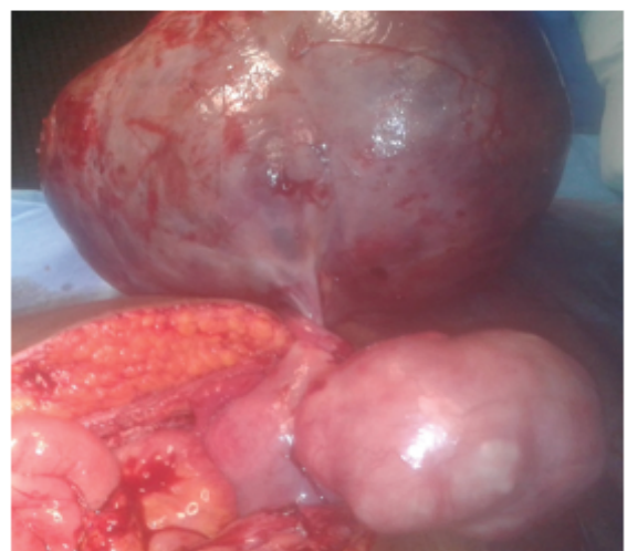
Figure 1: A pedunculated and twisted leiomyoma located in the fundus of the uterus.

This torsion occurs only on pedunculated uterine leiomyoma especially if the pedicle is long and thin. The size of the leiomyoma is a key factor in the onset of an irreversible twist. Tsai, in 2006 [6], had reported a case of sub-serosal fibroma measuring 8 cm in diameter. Our patient had a leiomyoma bigger than Tsai's with 15 cm of diameter and 3700 grams