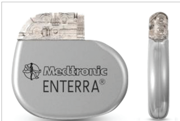
Figure 1: The Enterra device. This is an implantable system generating electricity, which is transmitted to the tissue via two unipolar leads.

On review of the literature, several expansions on the use of the Enterra device were discovered. First, defining a treatment algorithm for different types of gastroparesis would likely be beneficial. One study analyzed 22 patients who were treated with GES, but did not respond optimally to the initial neurostimulator settings. These researchers undertook an algorithmic approach to identify optimal parameters for gastroparesis of various etiologies. Interestingly, they found the post-surgical gastroparesis group required the most energy in its settings [12]. Since the pathophysiology behind different types of gastroparesis varies, the optimal neurostimulator settings likely vary as well.