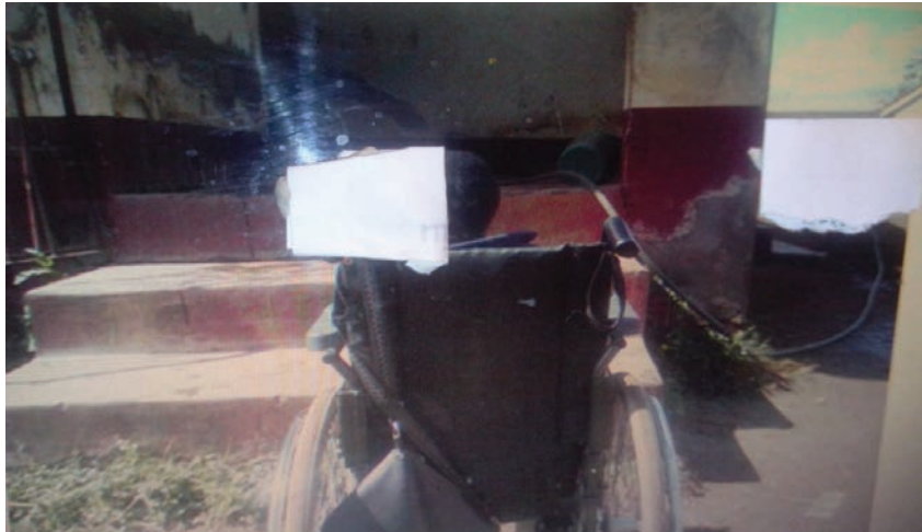
Figure 7: Girl Child in Wheelchair at Toilet Entrance.