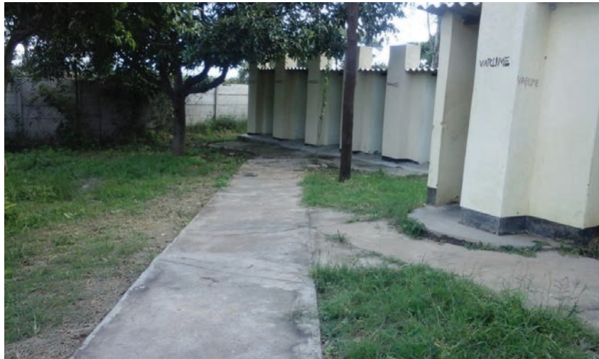
Figure 1: Blair toilets at a local hospital in Zimbabwe.