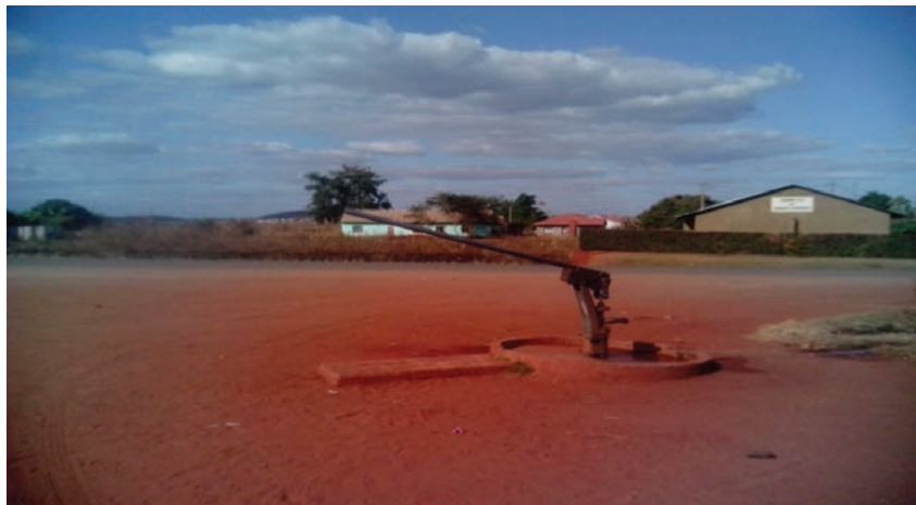
Figure 4: Public Borehole in Bindura, Zimbabwe.