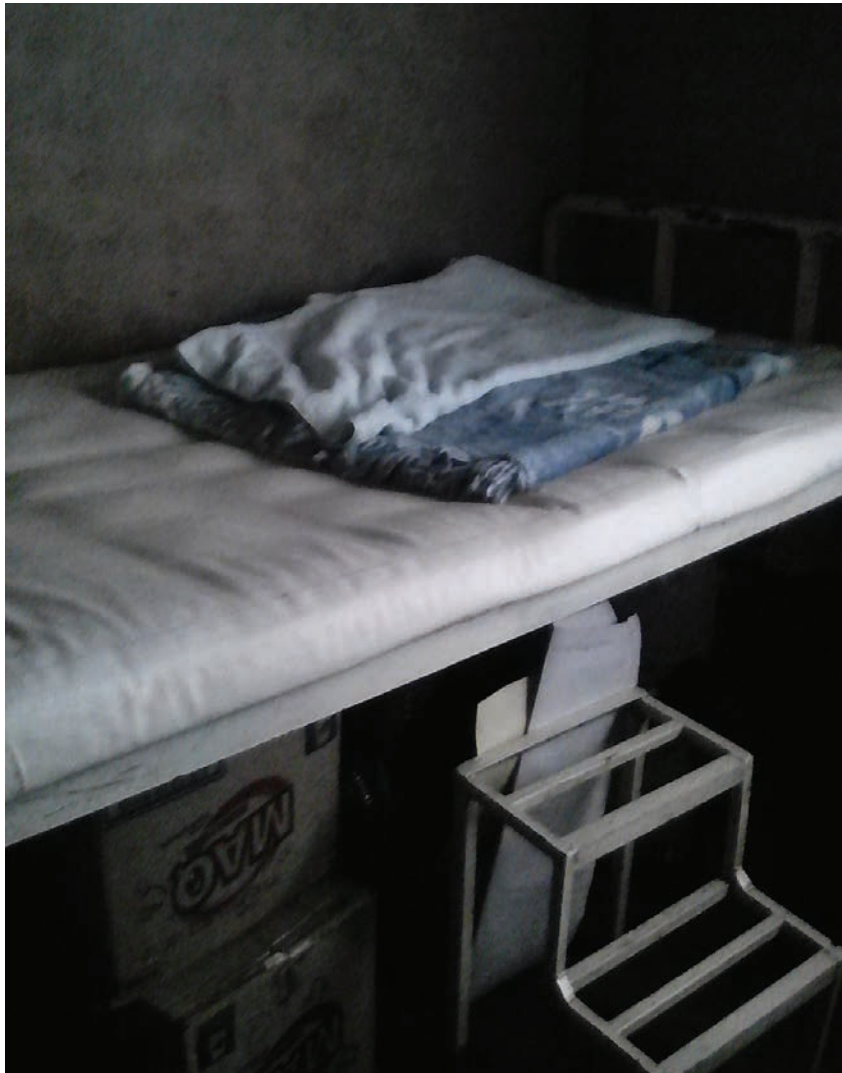
Figure 8: Bed where baby delivery takes place. Source: Chigunwe, 2018 [2]