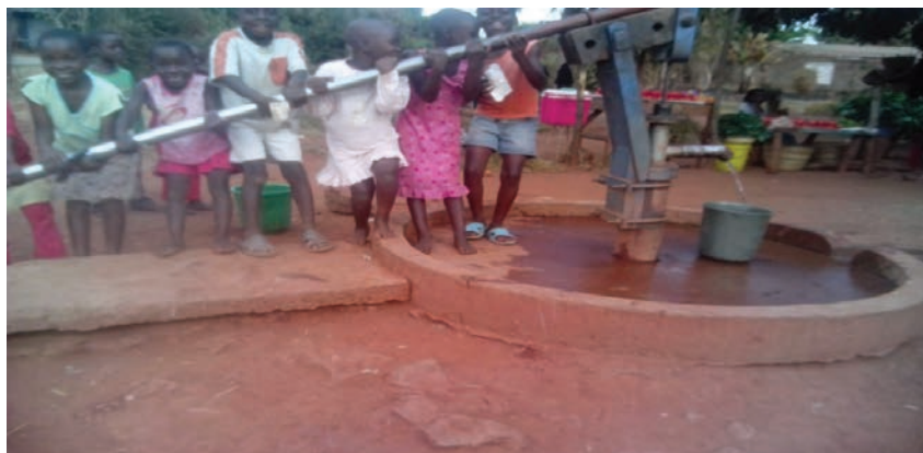
Figure 3: Public Water Boreholes.