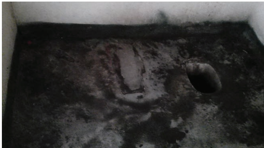
Figure 2: Blair toilet squatting hole.