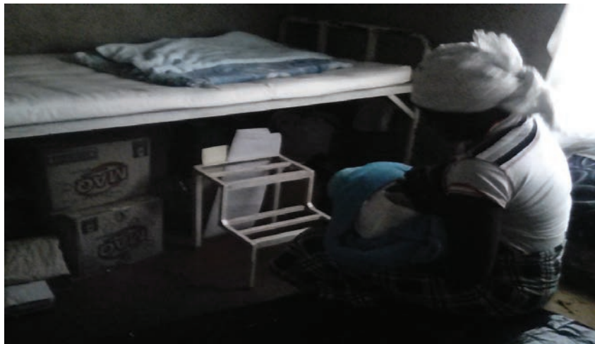
Figure 9: A woman breast feeding a newly born baby delivered in the home.