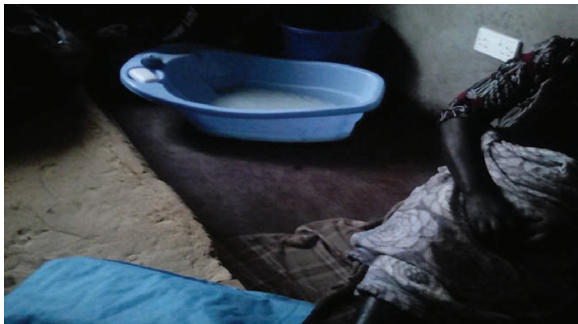
Figure 10: Seated in home labour room is the woman who assists in delivering of babies.