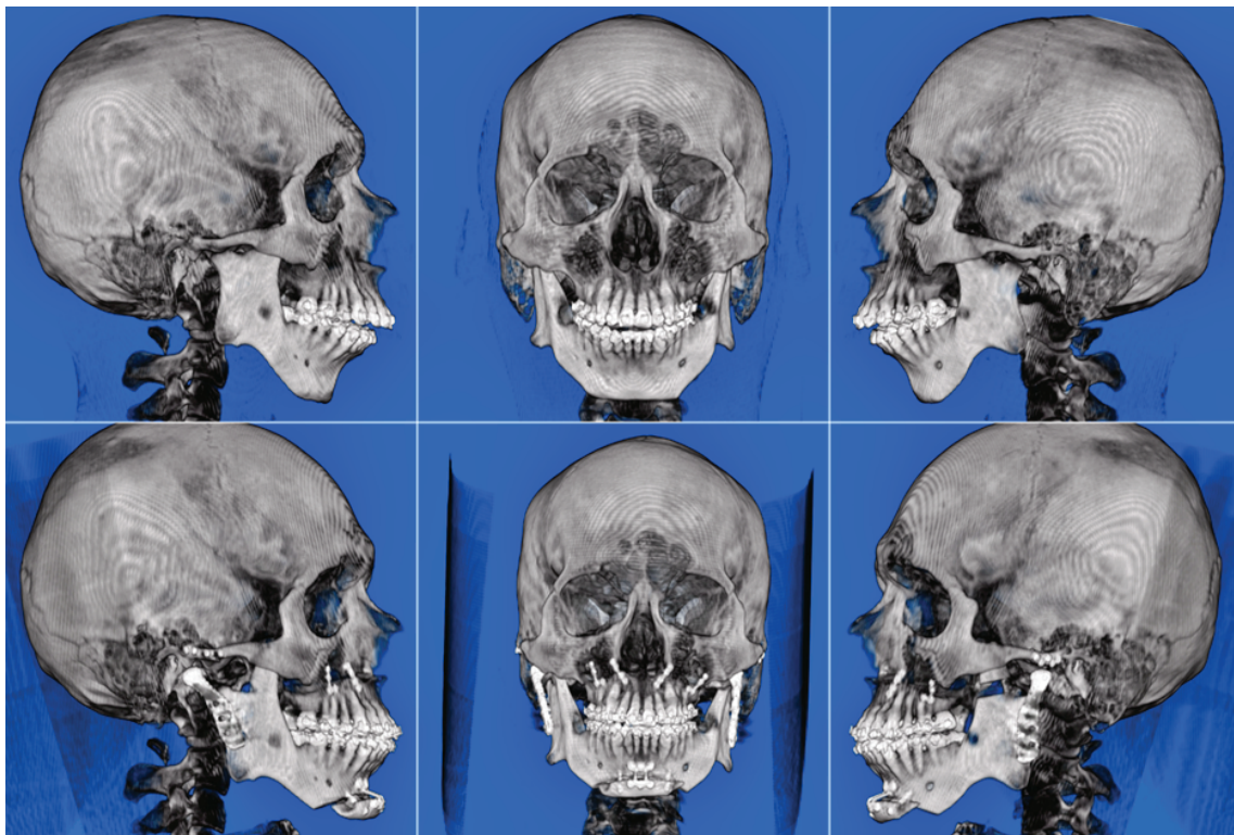
Figure 3: Shows the treatment of adult male complaining of condylar resorption and mandibular retrognathia using Le Fort I osteotomy, bilateral artificial joints, and genioplasty.