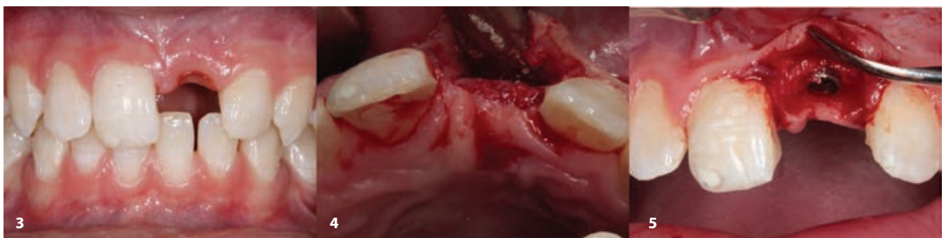
Figure 3-5: An advantage if the pubertal growth episode has already been completed.