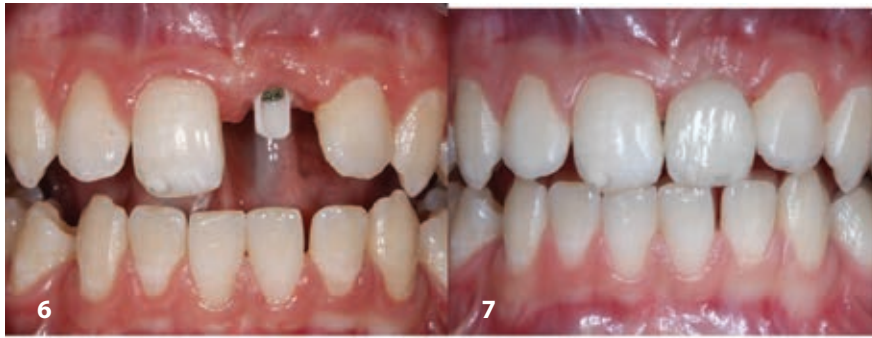
Figure 6 & 7: Potential growth was taken into account when planning the emergence profile of the mesiofacial growth pattern of the mid-face.