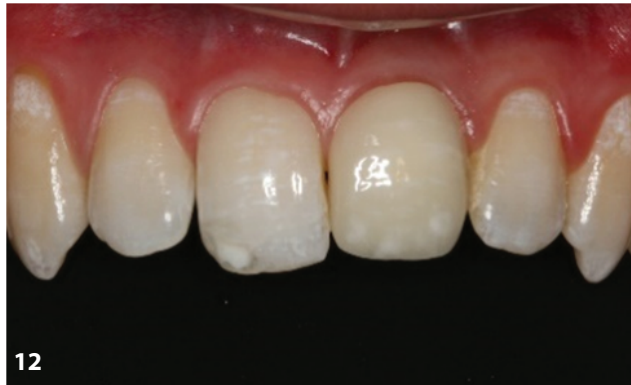
Figure 12: At the age of 19 years, 2 months, the incisal edge of the crown appeared slightly too short.