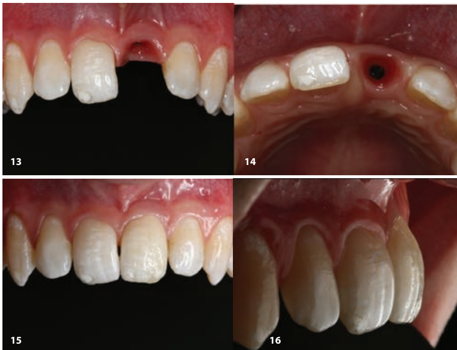
Figure 13-16: The excess tissue was used to form the emergence profile symmetrically to the contralateral tooth.