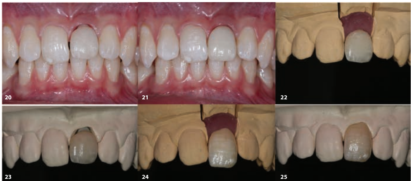
Figure 20-25: The changes due to growth can be seen clearly in the marginal and incisal regions.

carried out according to ethical aspects in the children's best interests as described in the "United Nations Convention on the Rights of the Child" by specially trained and experienced dentists drawn from a multidisciplinary group encompassing the specialist fields of pedodontics, orthodontics, prosthetics and oral surgery. No consensus was agreed upon for the optimum age of patients for implant measures.