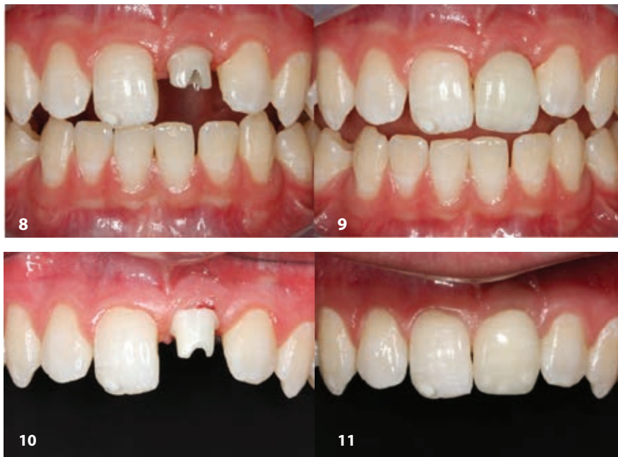
Figure 8-11: The patient's body grew 24 cm in length during this period and the prosthetic restoration was twice adapted to the growth episode and continued to exhibit excess hard and soft tissue around the marginal emergence profile.

corrected using time-consuming and risky augmentation techniques [23,24]. The outcome is often unsatisfactory as loss of hard tissue causes atrophy of the soft tissue. This often leads to loss of attachment on the adjacent tooth which is difficult or impossible to reconstruct. Although early implant placement conserves the bone, considerable risks are involved as the implants do not follow the complex three-dimensional development of the jaw and alveolar process [6,12]. This may cause considerable disadvantages for the functioning and aesthetics. In their 4-year retrospective study Bernard JP, et al. [9] monitored infraclusion of implant-borne anterior crowns. The survival rate of implants placed before the age of 13 was approx. 20% higher than in older patients [5,2]. The complications were increased by the fact that the growth of individual patients is difficult to estimate-the teeth may drift mesially by up to 5 mm [9]. Owing to these risks, it is now recommended that implants not be placed prior to the age of 19 years [10,6,7]. In contrast, the morphological and psychosocial aspects of early implant placement are considered positive. The literature increasingly includes reports about implant-borne restorations placed during the growth phase. This applies particularly to patients with