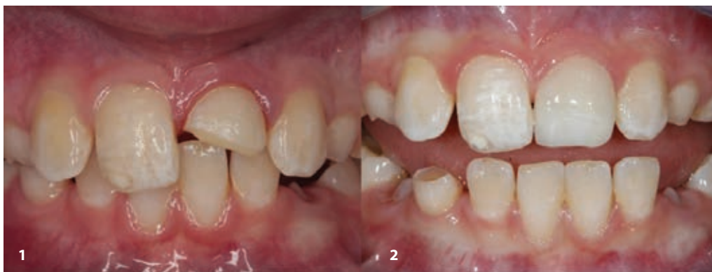
Figure 1 & 2: Conservative treatment involving direct pulp capping followed by endodontic procedures was performed in an attempt to retain the tooth and restore its aesthetics as well as masticatory functioning.

In case of agenesis or upper anterior tooth loss in children and adolescents, conventional restorations exhibit serious drawbacks and sometimes have negative consequences for the dental and psychosocial development of these young patients [1,16,20-22]. One of the serious problems is bone loss in the affected region which often can only be