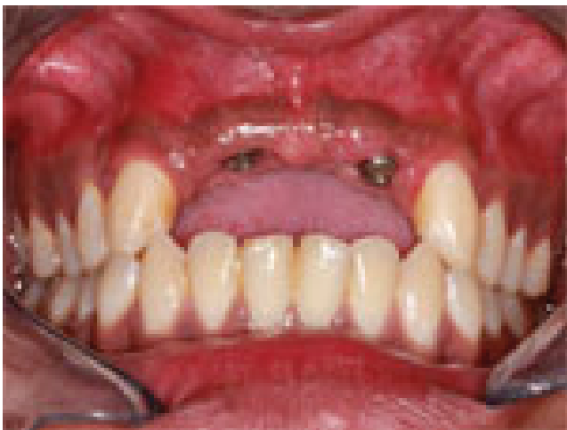
Figure 1: Initial tissue architecture showing obliteration of interdental papilla.