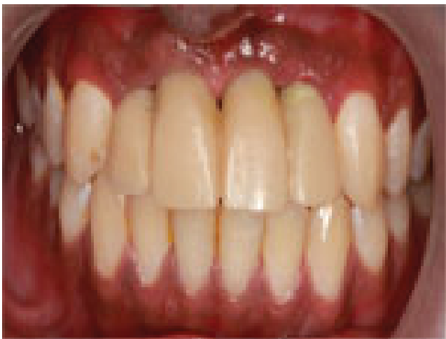
Figure 2: Customized interim fixed prosthesis.