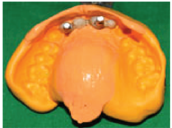
Figure 5: Interim prosthesis seated in the impression.