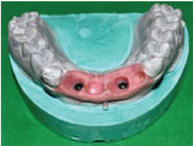
Figure 7: Soft tissue architecture and emergence profile transferred to the definitive cast.