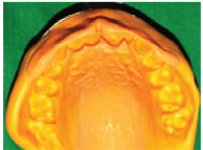
Figure 4: Polyvinyl silicone impression made over interim prosthesis.