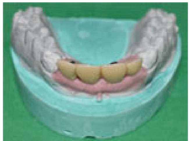
Figure 6: Retrieval of definitive cast.