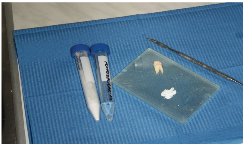
Figure 1: The own novel Biphasic porous calcium phosphate ceramics, containing an active tetra calcium phosphate/monetite mixture (TTCP/M) was used in our study.