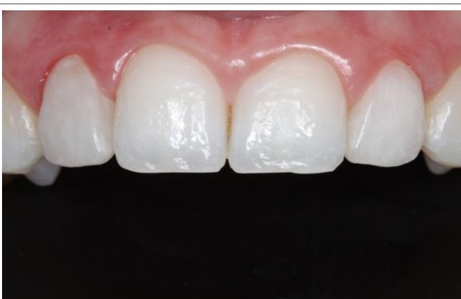
Figure 4: Immediate final aspect of the case