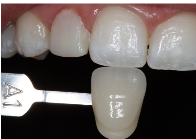
Figure 3: Photography for color selection of ceramics. Observe in the interim bisacrílica resin in the tooth 12

Survival rates of ceramic veneers in clinical studies have been reported to be 82.93% after 20 years in service, with 44.83% of the total failures caused by fractures in this period of observation [13], and in pieces cemented to the dentin substrate [12]. This high success rate is attributed,