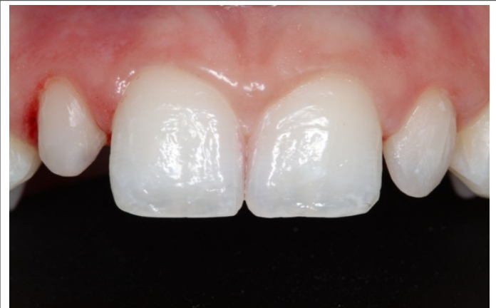
Figure 2: Clinical aspect after removal of composite resin restorations in teeth 12 and 22

of the central incisors, the composition of the smile, in general, was satisfactory and constituted a harmonious whole, thus revealing the need for prosthetic intervention alone in the conoid teeth.