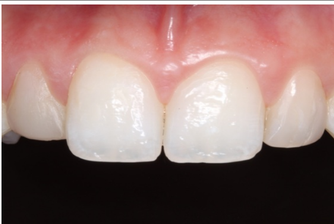
Figure 1: Initial clinical aspect of the case