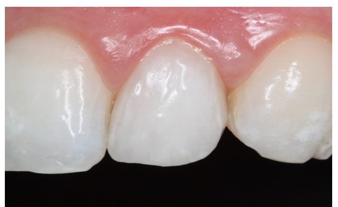
Figure 7: Aesthetic result after 2-year of cementation of restorations. Left side view

pigmentation, fewer fractures, and high biocompatibility characteristics that translate into satisfactory mechanical strength and high esthetics [11,12].