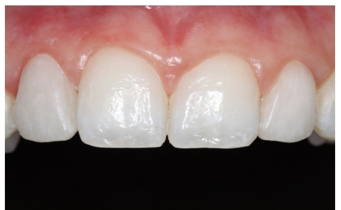
Figure 5: Aesthetic result after 2-year of cementation of restorations. Front view

The search for a beautiful smile, or one that matches the esthetic standards of today, provides the growing use for ceramic restorations. The aim is to promote changes in the tooth form for example, the closure of diastemas or to promote color changes in pigmented teeth, besides replacing resin restorations that are direct or indirect. Such changes are likely to be carried out successfully owing to the characteristics of ceramics, which include greater clinical longevity, lower susceptibility to