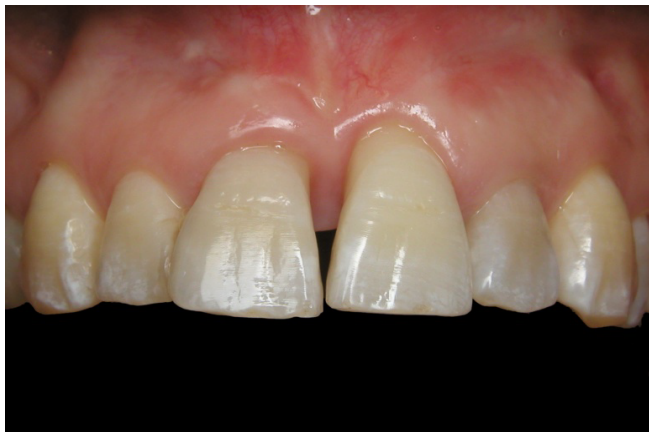
Figure 3: Intraoral close-up photography one month after surgery.