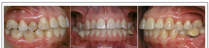
Figure 1: Initial intraoral photographs: A – right side; B – frontal and C – left side.

It is strongly advised that the diagnosis of mesiodens should be made at an early phase possible due to its associating with disturbances in tooth eruption [3-5]. This is not the case in this clinical report since the patient was referred to the orthodontist at 30-year-old with an undiagnosed and asymptomatic that seemed to be innocuous to the occlusion. It is therefore