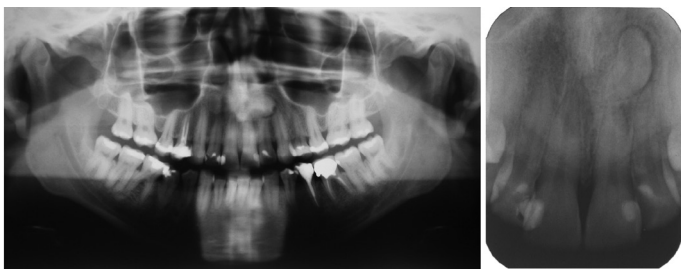
Figure 2: Initial radiographs: A – panoramic and B – periapical.