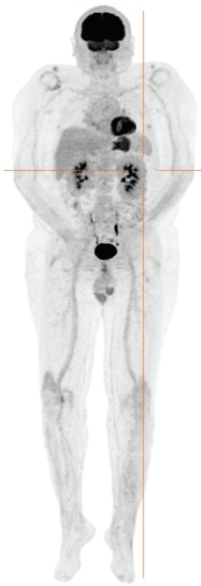
Figure 3: Coronal section of extended PET CT demonstrating low density perinephric soft tissue infiltration and a right piriformis mass with low-grade metabolic activity. Intramedullary calcification in the long bones surrounding the knees also show low-grade metabolic activity. These lesions likely relate to Erdheim-Chester disease.

With the exception of microscopic hematuria, laboratory findings were unremarkable including a complete blood count with differential, liver function tests, creatinine, serum electrolytes, ESR, CRP, urine osmolality and glomerular filtration rate.