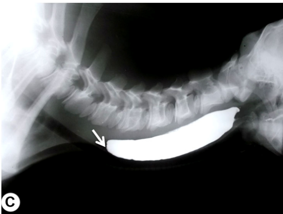
Figure 3: Contrast x-ray film in a latero-lateral view of the cervical region shows the contrast medium inside the esophagus, the radio opaque area is the dilated part from the esophagus. The white arrow indicates the seat of the membranous obstruction