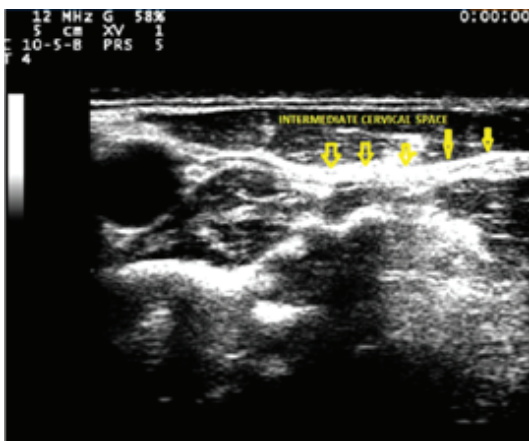
Figure 1: Bloc Cervical 1