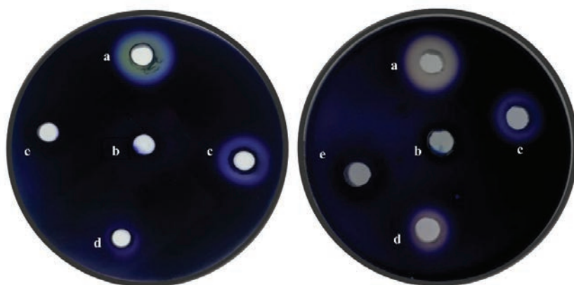
Figure 2: The starch agar plate after treatment of alpha-amylase (0.5 mg/mL) with MKE and EKE (a) Positive control (b) Negative control (c) 60.0 mg/ml (d) 80.0 mg/ml and (e) 100.0 mg/ml.